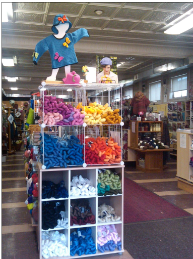
...one of our specific-fiber yarn stations