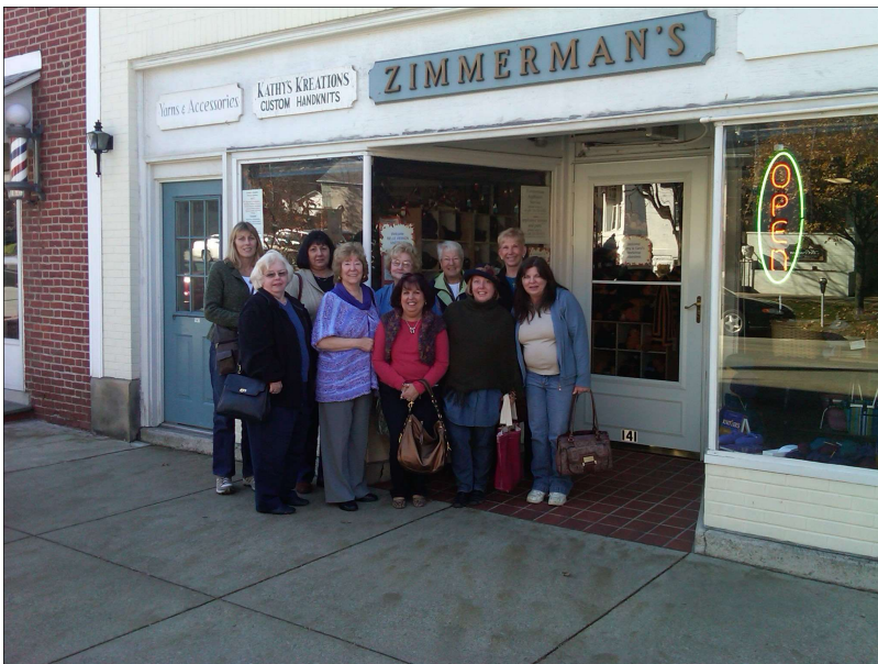
...Rostraver Library knitting group field trip

all groups, great and small, are welcome at Kathy-s Kreations