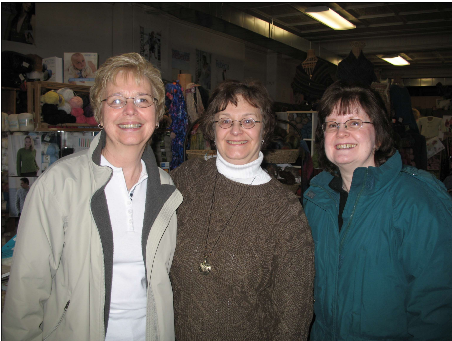
...a happy day at the shop