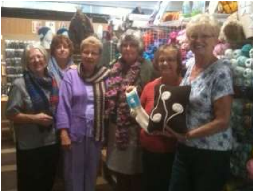
a Fun Friday knitting group, with their projects and Goddess scarves