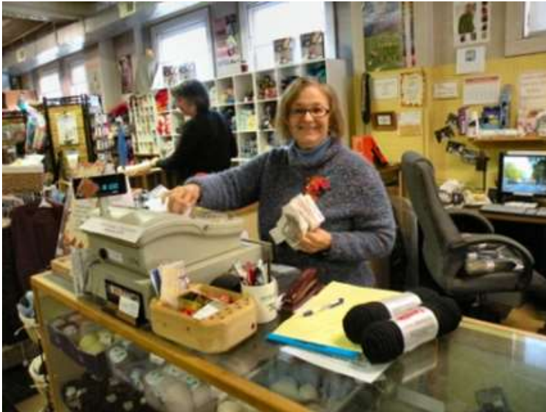
...a busy day at the shop