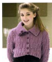
© 2007 Nashua Handknits / WFI

Theatre --- special occasion and evening wear sweaters & wraps