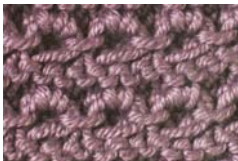
TABLE RUNNER DIRECTIONS: Cast on 62 sts. Knit 5 rows. Work in pattern stitch until piece measures 59" or 1" less than desired length. Knit 7 rows. Bind off all stitches as if to knit. Block to measurements.

© 2009 Kathy Zimmerman. For personal or charity use only. Please feel free to share these patterns with your friends, but do not use for commercial purposes without permission of the designer, Kathy Zimmerman. All rights reserved.